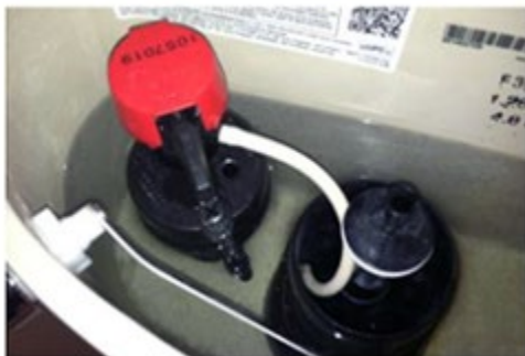
Incorrect (Detached Hose)